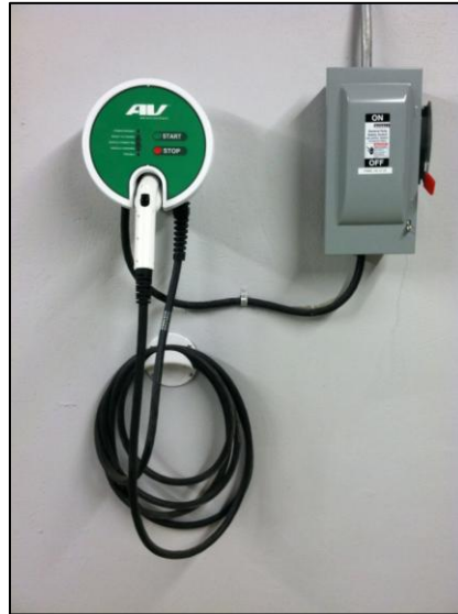
AeroVironment Charging Station

To accommodate electric vehicles, SRHT has installed a charging station in the garage. This allows residents or employees to charge their vehicle while in the building, which conveniently reduces trips to larger charging stations.