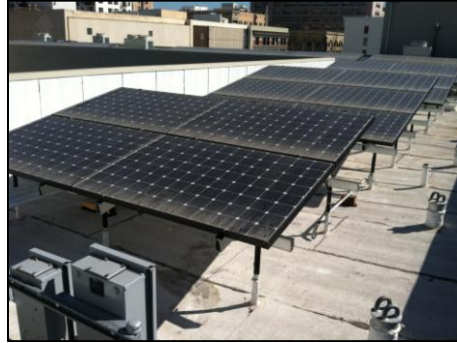
New Genesis Photovoltaic Panels

A photovoltaic (PV) system has been installed on the roof to convert solar energy from the sun into usable electricity for the building. Solar power is also beneficial to the environment because unlike coal and natural gas, solar does not cause any air pollution and does not require consumption of a limited natural resource. Solar is more efficient because it is generated locally and does not suffer the typical energy losses due to transport that occur with power plant energy production. The PV system at New Genesis is located on the top of the roof.