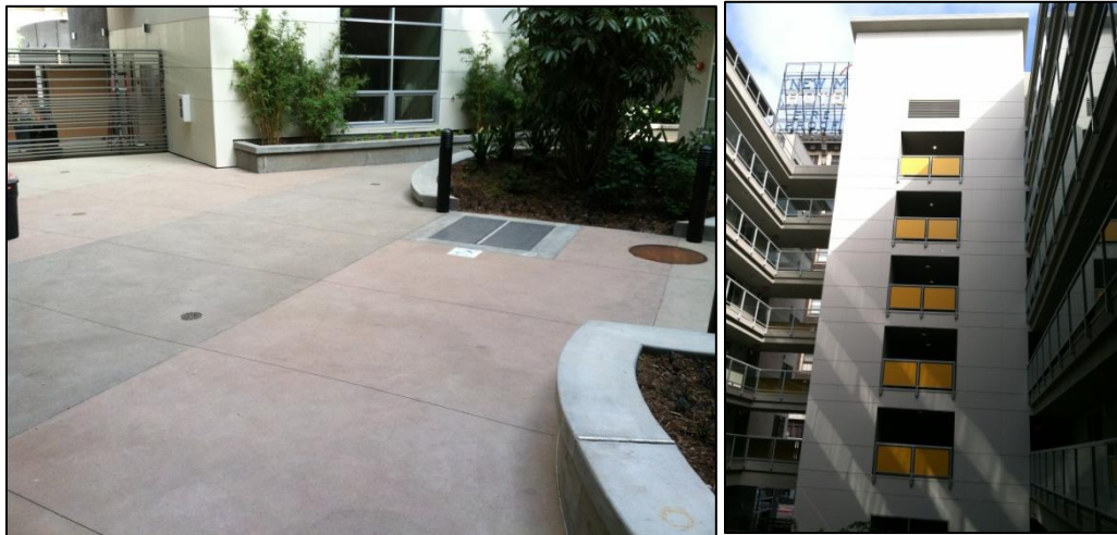
High Albedo Materials Used for Walkways and Exterior Walls