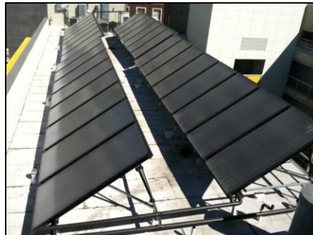
New Genesis Solar Thermal Panels

Like the PV panels, the solar absorbing panels are also located on the roof of the building.