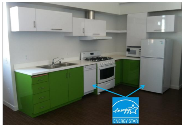
Energy Star Appliances

Energy Star is a program where the Environmental Protection Agency (EPA) evaluates products for energy performance so that we can reduce greenhouse gas emissions and energy costs by purchasing efficient appliances. The apartment is equipped with a refrigerator and dishwasher that exceed the federal energy standards.