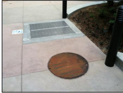
New Genesis Dry Well

The site is equipped with a dry well to manage almost all (98%) of the storm water on site. The system collects runoff from impervious surfaces, such as the roof and concrete walkways, through a drainage system that disperses the water deep below ground. The well is located in the center of the courtyard.