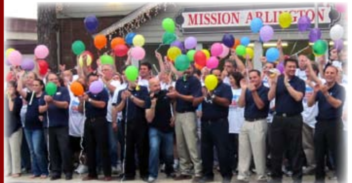
"Surprise:" New computers unveiled

All of these volunteers were on hand for the "big reveal" moment when the bus - or in Mission Arlington's case - two trucks - were moved. Hundreds of balloons were released, as everyone shouted "MOVE THOSE TRUCKS!" It was a lot of fun. We are so grateful.