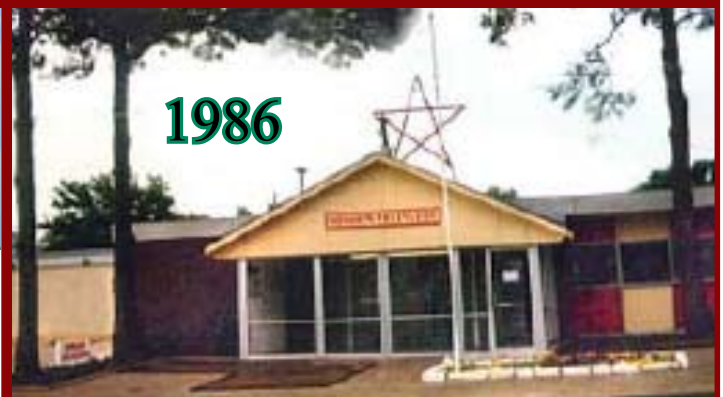
THE MISSION OFFICE IN THE 1990'S

We look forward to the future. Together we can make a difference in this community. Glory to God!