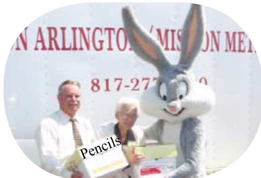
SIX FLAGS "WRITES IN" MISSION ARLINGTON®