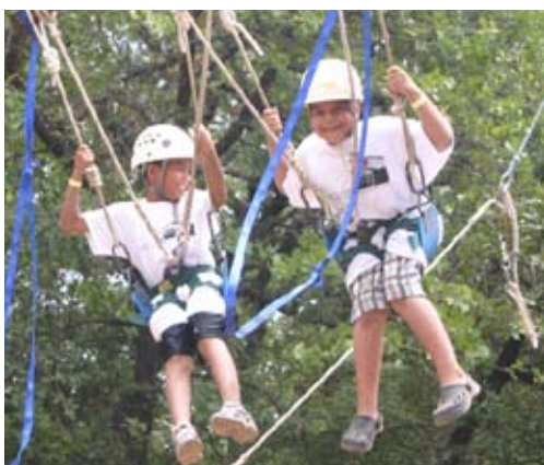
FLYING THROUGH THE AIR AT CAMP

We hosted SEVEN FREE CAMPS for the young people in our community. 1,331 students attended these exciting and fun events in July.