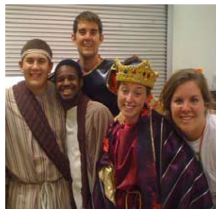
ACTING OUT BIBLE STORY AT CAMP

38,200 children attended Rainbow Express this summer. 1,282 people made spiritual commitments. 399 student groups came from 15 states to help, representing 9,884 people.