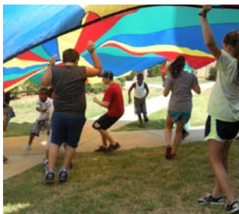
PARACHUTE FUN AT RAINBOW EXPRESS

We hosted SEVEN FREE CAMPS for the young people in our community. 1,331 students attended these exciting and fun events in July.