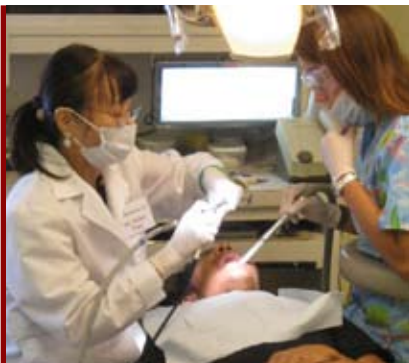
VOLUNTEER DENTISTS HELP TEENS