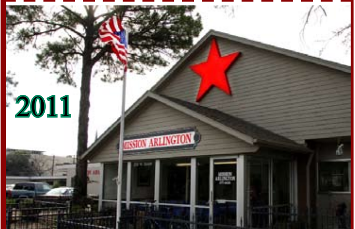
THE MISSION OFFICE TODAY