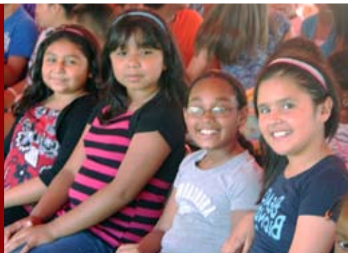
OUTDOOR SERVICES UNDER A TENT

United Concordia, the Texas Rangers, and Mission Arlington® came together to help Arlington's youth. 134 students saw the dentist and/or had their eyes examined.