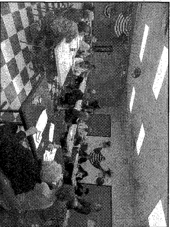
Residents attend NEWRA meeting.