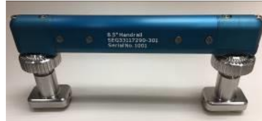
ISS Metallic Handrail