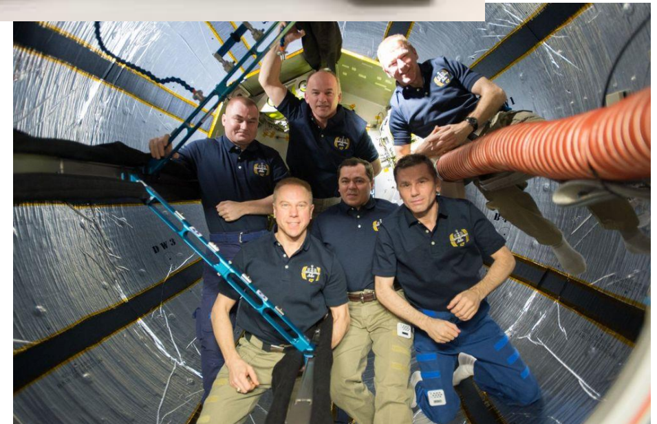
ISS Crew Inside BEAM Module