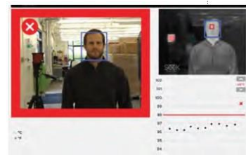
ABOVE ALARM TEMPERATURE