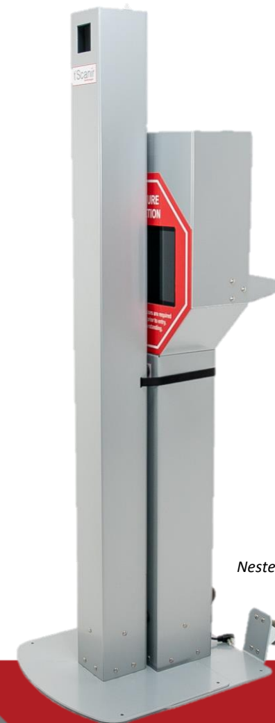
Nested for relocation