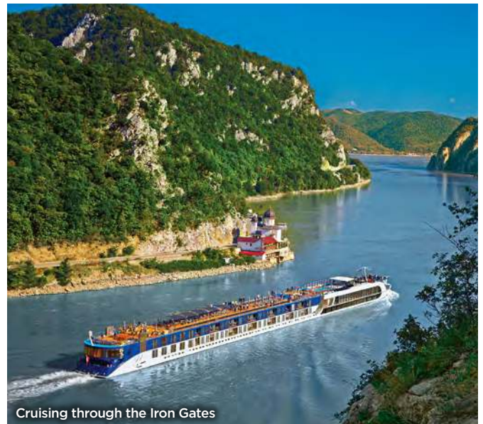
Cruising through the Iron Gates

Optional land extension available Pre-cruise 2 nights Vienna from $600 per person Post-cruise 2 nights Brasov & 2 nights Bucharest from $1,300 per person OR 3 nights Istanbul from $1,499 per person