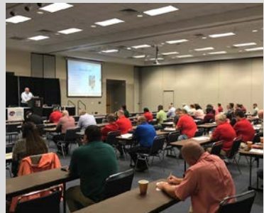
Three Certified Facilities Director (CFD) classes were offered at the event.