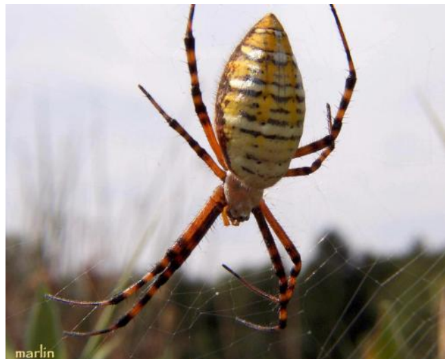
Silver Argiope http://www.cirrusimage.com/

The silver Argiope, Argiope trifasciata , is nearly as large as the black and yellow garden spider. In Edgewood it may even appear to be larger in some specimens. Also occurring from coast to coast, this species tends to live near marshes in the east. It matures later, usually around September 1. The egg cases are light gray with one side flattened. This species tends to open up a space in the grass where the web is spun, like a ball-shaped cavity.