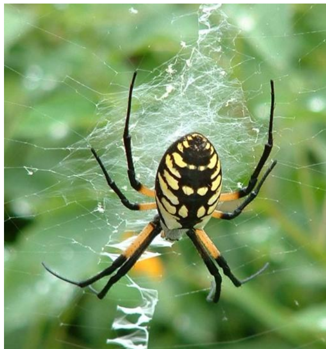
Black and yellow garden spider

With the possible exception of the Bay checkerspot butterfly, many people think only of the large vertebrate animals when they think of the wildlife of Edgewood. In fact, the majority of animal species in the park are insects and other arthropods. They are also the most numerous.