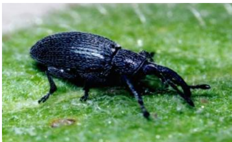
Root crown weevil, Ceratapion basicorne

on the root crown weevil Ceratapion basicorne and permission for field