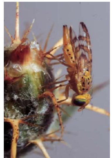
False peacock fly, Chaetorellia succinea

this difficult gap in successful insects, four more insects and a mite are being tested along with four more fungal diseases. If one of these is as effective as the two already successful controls, maybe YST will finally become uncommon.