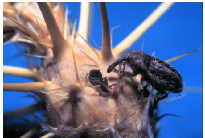
Hairy starthistle weevil, Eustenopus villosus

The root crown weevil feeds on the plant during the vegetative period long before seeds are forming. The larva eats the inside of the root just below the rosette, cutting off the leaves from the root and killing the plant. The history of successful insect releases for YST is not good however. Of six species approved for release, only two insects are common and doing extensive damage: the hairy starthistle weevil ( Eustenopus villosus ) and the false peacock fly ( Chaetorellia succinea ), and the latter was not one of the insects approved for release. To cover