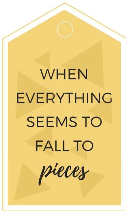
(Reese's Pieces candy)