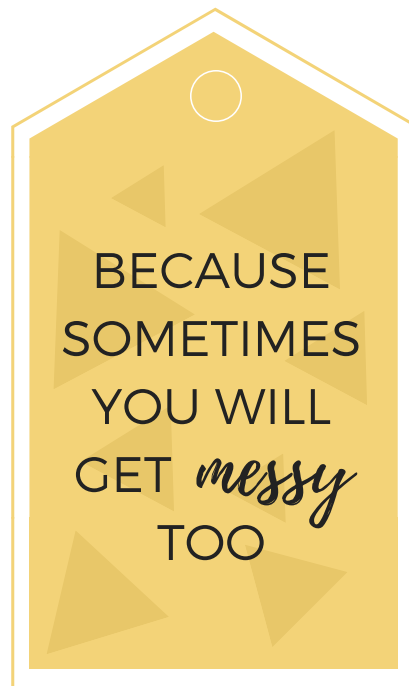
(men's body wash or bar soap)