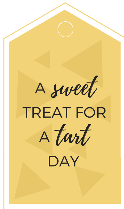
(Sweet Tart candy)