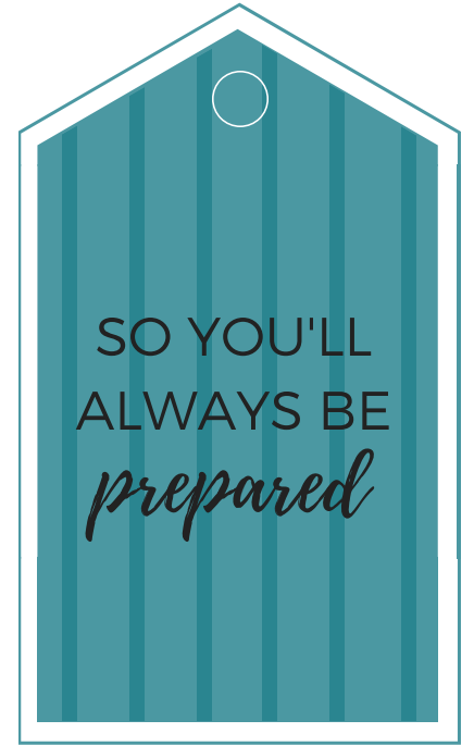
(travel first-aid kit)