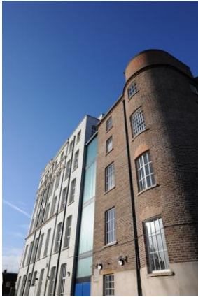
Newly refurbished entrance to Conway Mill.