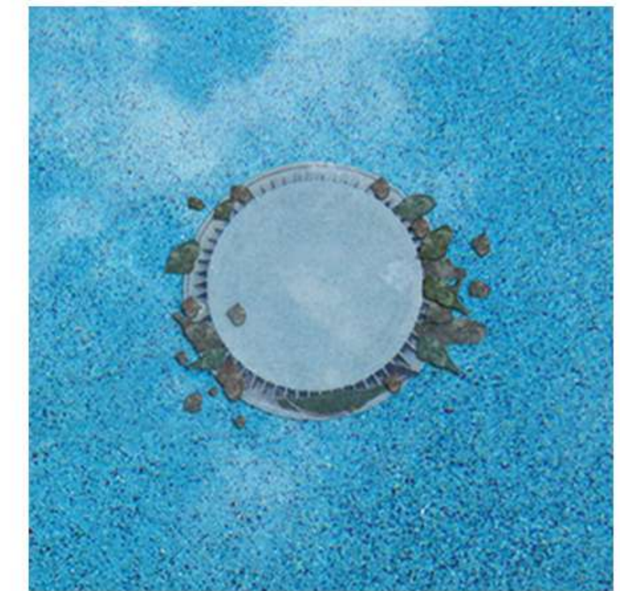
Typical pool drain with debris unable to exit pool