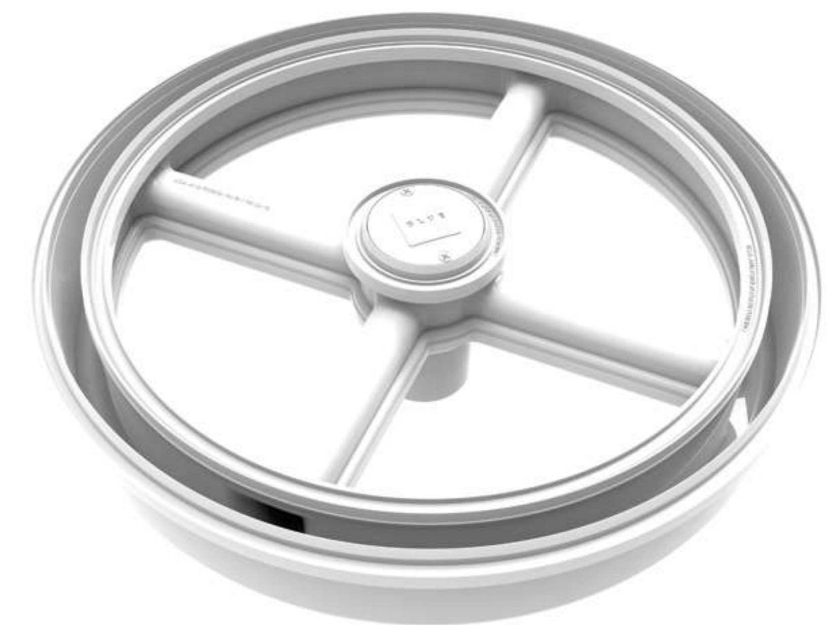
Innovative circular channel design