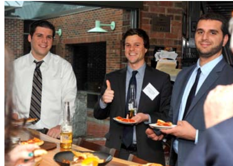
Candidates and Advisors network after the Princeton Conference