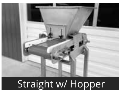
Straight w/ Hopper