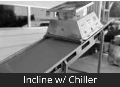
Incline w/ Chiller