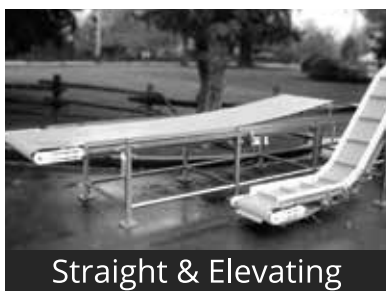
Straight & Elevating