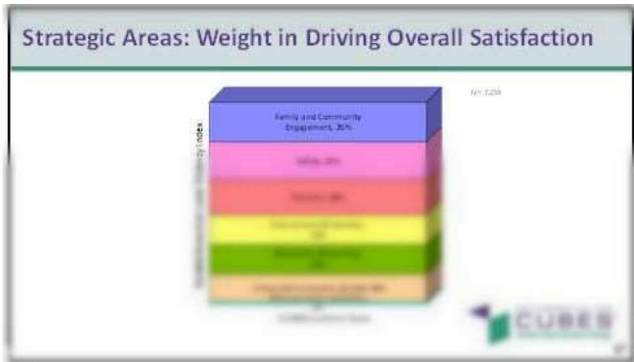
Exhibit 2: Weight Given to Strategic Areas