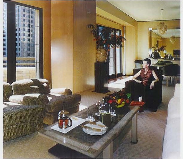
Suite #3207, at Four Seasons Hotel New York.

M andarin are creeping up steadily, now at second place and with 3% more votes than last year. Four Seasons, though, have not only retained top slot, but have also upped their percentage from 29% to 31.5%. The ever popular Pen has also moved up a slot, as has the consistently superlative Four Seasons Chicago; but the big surprise is the complete absence this year of the New York St. Regis, and the inclusion in this category of newcomer, Four Seasons San Francisco, which readers appear to like as much as we did.