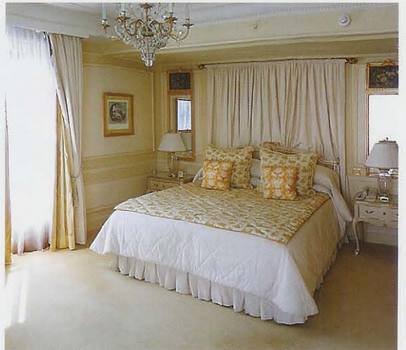
Individually designed suites at Four Seasons Hotel George V, Paris.

those readers who loved, say, Soho Hotel in London or Bvlgari in Milan did not send in their voting forms. The voters this year went instead for the traditional Grandes Dames in all their glory; a loyal following raising Four Seasons Milan from fourth place last year, to second. The Lanesborough in London disappeared entirely, whilst Claridge's, now owned by Quinlan and operated by their Maybourne Hotel Group, shot up in your estimation, and returned once again to these pages. Sadly, nothing else scored sufficient votes to be counted this year.