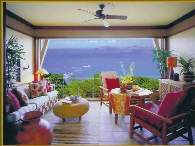
Four Seasons Resort Costa Rica.

The Gallivanter's Guide ® Award for Excellence 2005