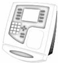
IT-3100 WITH FINGER READER

We suggest employees wash and dry their hands before punching. We do NOT recommend hand sanitizer because of its ingredients. Employees can use non-alcohol based hand cleaners/sanitizers. Doing so will avoid potential damage to your clock. Do not use formulas with Benzalkonium Chloride (BAC) and Parachlorometaxlenol).