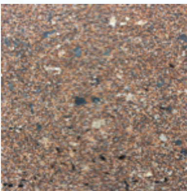
DP - 3040 MAHOGANY