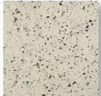
DP - 3043 DESERT SNOW