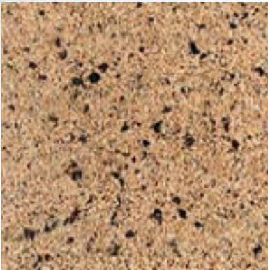
DP - 4796 AUTUMN BLAZE

Decoplast Marmomix Mica is a 100% acrylic polymer material engineered to provide a durable and decorative finish. Decoplast Marmomix Mica finishes are architecturally decorative and will withstand thermal expansion and contraction without delamination. Custom colors and custom matches are available on request.