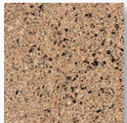
DP - 4795 PUEBLO