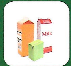
Milk & Juice Cartons & Juice Boxes