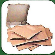
Cardboard & Pizza Boxes Flattened