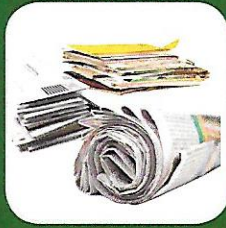
Junk Mail, Mixed Paper, Paper Bags & Newspaper