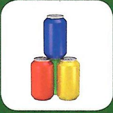
Aluminum Cans, Foil & Trays