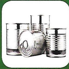
Metal Food Cans