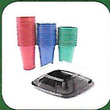
Plastic Food Trays and Cups