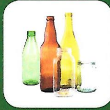
Glass Bottles & Jars Lids Removed