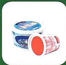
Wide-Mouth Plastic Containers #1-#7