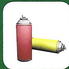
Empty Aerosol Cans Lids Removed