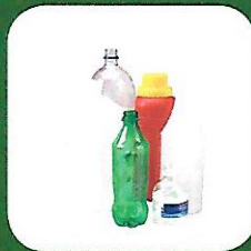
Plastic Bottles and Jugs