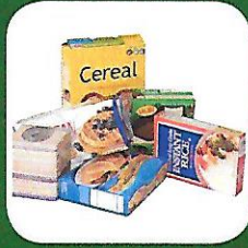
Cereal & Food Boxes Flattened