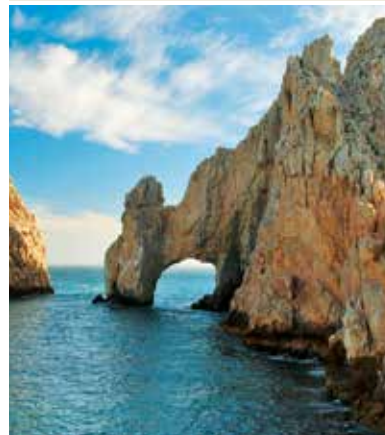
Cabo San Lucas