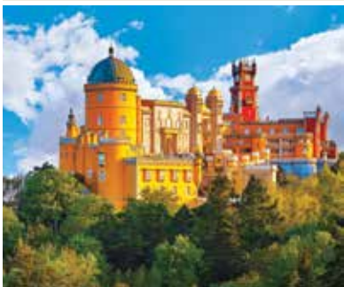
Sintra, available from Lisbon