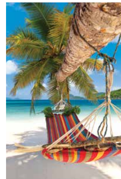
Top: Castries; bottom: St. John's

*All fares are per person based on double occupancy, including 2 for 1 savings, bonus savings and government fees and taxes. OLife Choice amenities are per stateroom. *Cruise-Only Fares do not include OLife Choice amenities or airfare. All offers are subject to Terms & Conditions.