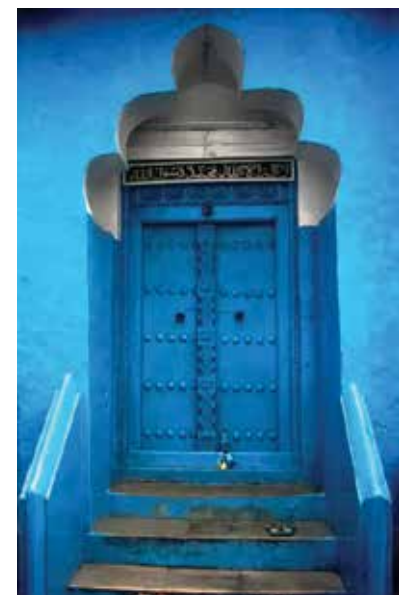
Top: Taj Mahal, available from Mumbai; bottom: Zanzibar

*All fares are per person based on double occupancy, including 2 for 1 savings, bonus savings and government fees and taxes. OLife Choice amenities are per stateroom. *Cruise-Only Fares do not include OLife Choice amenities or airfare. All offers are subject to Terms & Conditions.