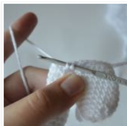
... sc in next 5 st of pipe ...