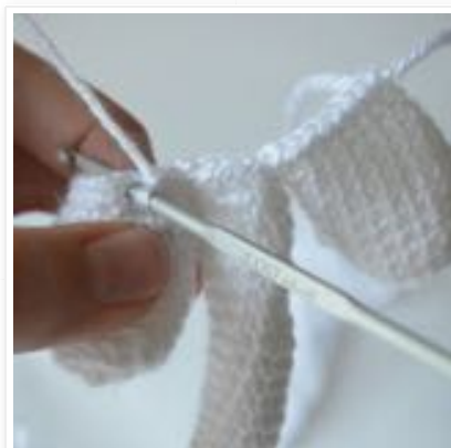
... sc in next 16 st of the first stand you made ...

After round 1 your stands should look ... well, let's just say I had a good giggle at this point. Moving on to round 2 --