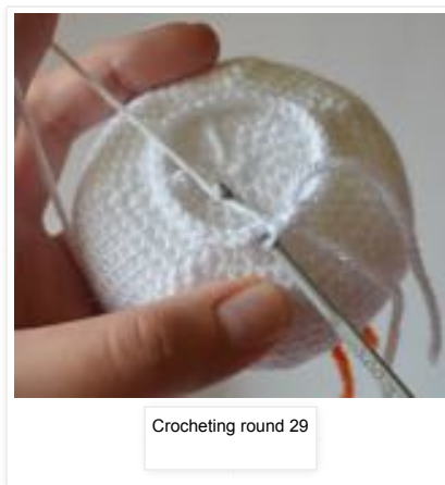
Crocheting round 29