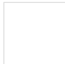
The Mallet, the Common Cold and the Splat