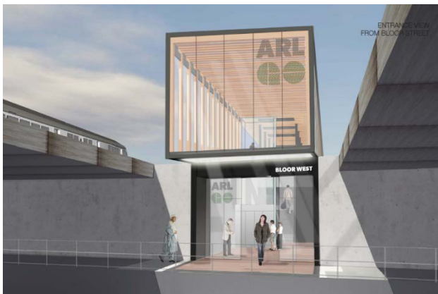
An artist's rendering of the improved Bloor GO/ARL Station in 2015.

We apologize for the inconvenience and thank you for your patience as we improve Bloor GO Station.