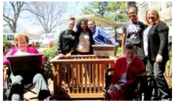
“Rolling Planters for... Residents” 2015