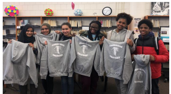
“CRLS Department of English Language Learners Community Building Project” 2019