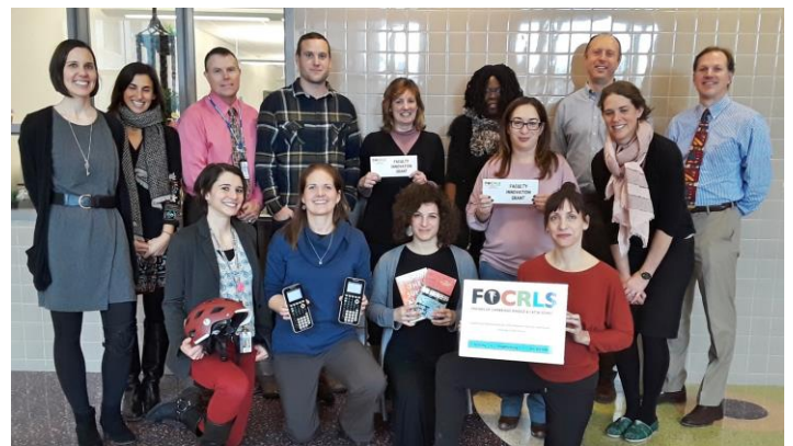
Faculty Innovation Grantees 2018