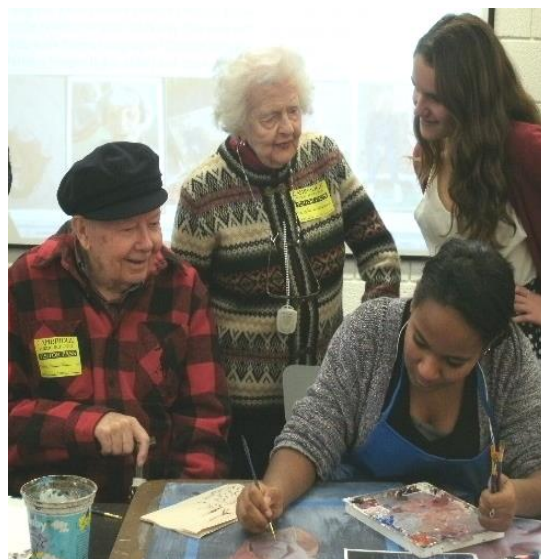
"Seeing the Unseen Part II" w/ Youville 2012