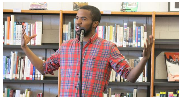
"Black History Month Performance Poetry Celebration featuring Joshua Bennett"