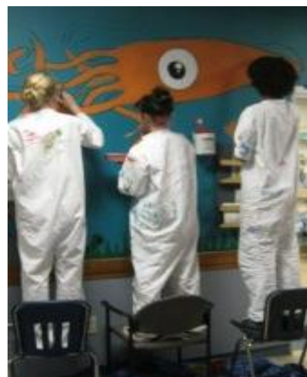
“Student Mural at Cambridge Hospital” 2011