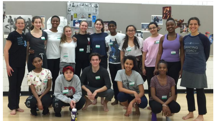
“The Etude Project” 2016