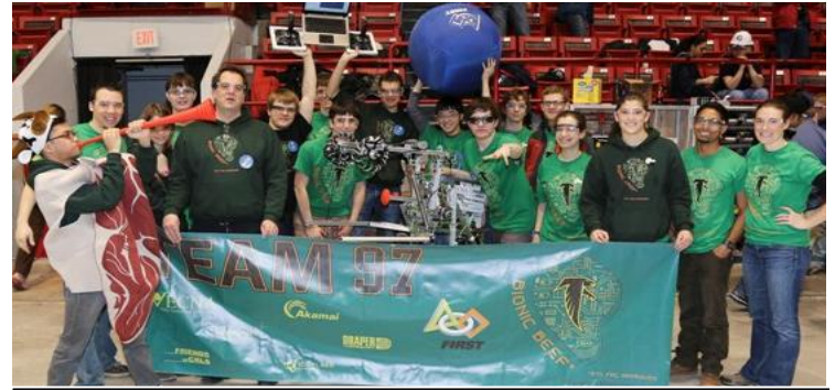
“Funding for FIRST Robotics Club 2014 Season”