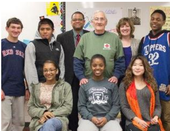
“Veterans History Project” 2016