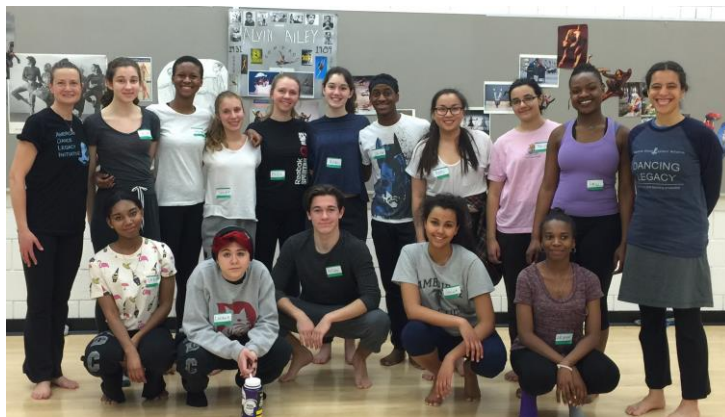
"The Etude Project" 2016