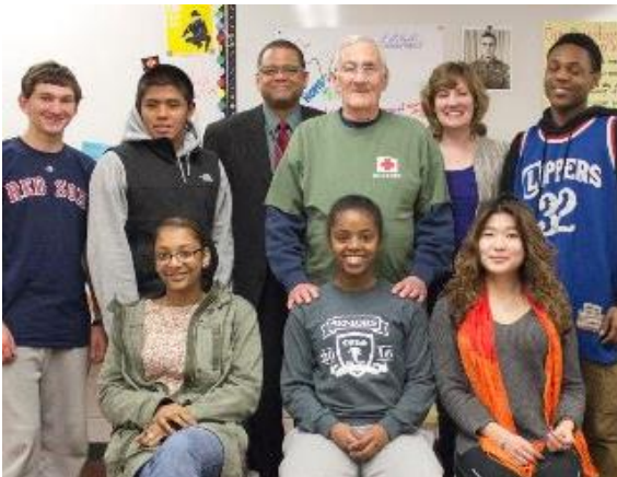
"Veterans History Project" 2016