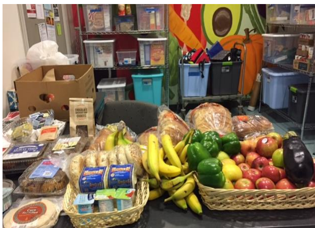
"Falcon's Market" 2016