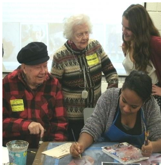
"Seeing the Unseen Part II" w/ Youville 2012