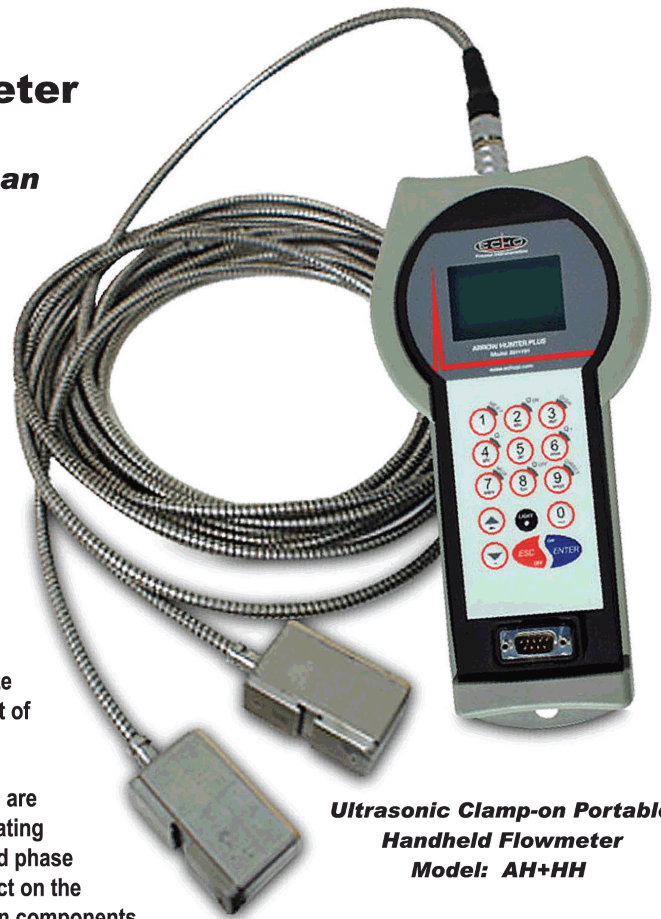
Ultrasonic Clamp-on Portable Handheld Flowmeter Model: AH+HH

The ultrasonic sensors are clamped onto the outside of the pipe, thus eliminating the need to dismantle the pipe work and interrupt the process. The AH+HH can be applied to any type of metal or plastic pipe with or without a liner carrying clean or dirty liquids. We have several transducers to choose from depending on pipe size, process temperature and required hazardous approvals.