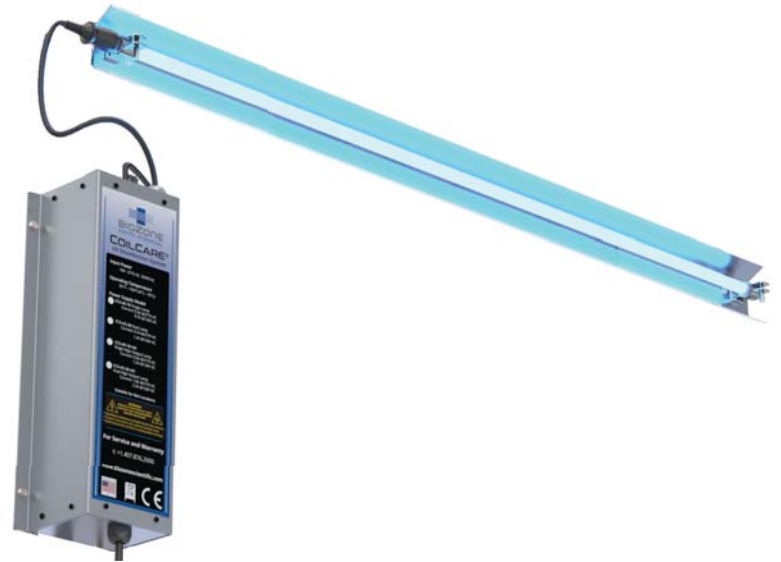
CCX System System Shown Mounted for Cooling Coil Treatment