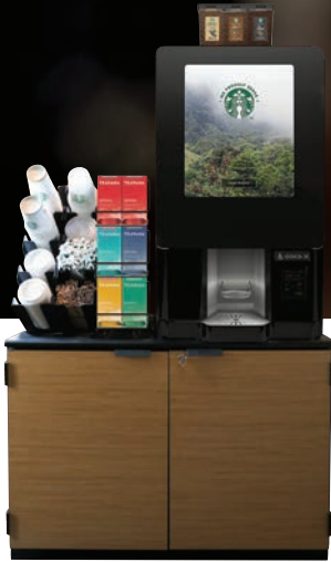
Serenade™ single-cup brewer featuring Seattle's Best Coffee® also available