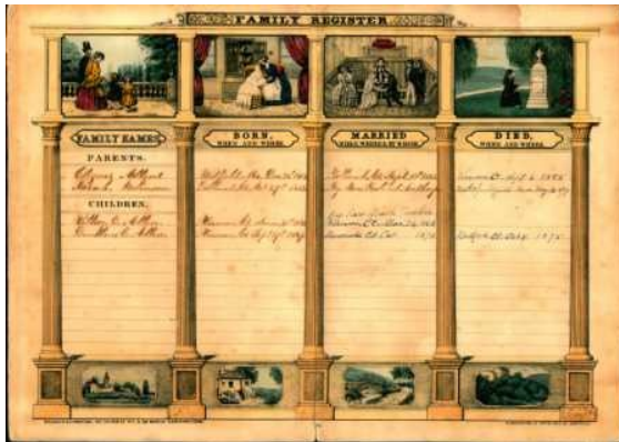
Bible Record from Special Genealogy Files