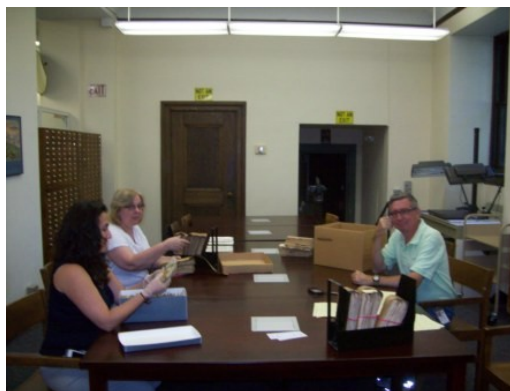
Archives Reading Area

http://libguides.ctstatelibrary.org/hg/home , and click on Access Archives.