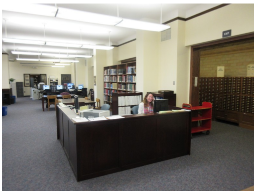
History & Genealogy Reference

On our website you can find links to the Library catalog, State Archives Finding Aids, Digital Collections, and information about our collections. Visit us at ctstatelibrary.org .