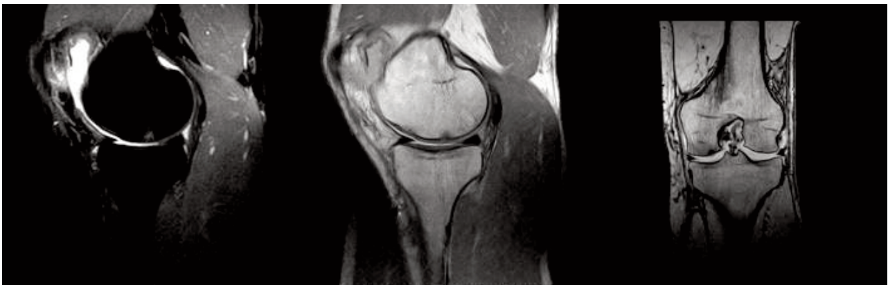
Figure 1. Chondral lesion in the medial femoral condyle after knee trauma. In both STIR and T2 weighted sequences it's well documented a focal chondral lesion (Outerbridge 3) with subchondral edema.

The patient was discharged the same day, with the prescription of a period of relative rest and protected weight bearing for about 10 days. At 2 weeks, the patient resumed usual activities, including sports, but, 3 months after, was selected for a single injection of autologous micro-fragmented adipose tissue (Lipogems ® ) because of the persistence of pain and the unsatisfactory results. No restrictions of activity nor rehabilitation protocol after Lipogems ® treatment were done for this patient, which was treated as an outpatient. Full weight bearing and walking was permitted.