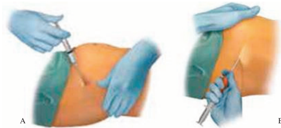
Figure 2. A-B, Harvesting of adipose tissue.

After a first period (approximately 10 days) of worsening of pain, symptoms got progressively better and the pain completely disappeared in 6 weeks.