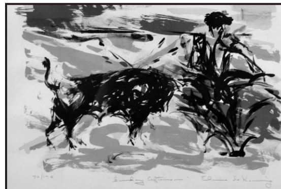
"Sunday Afternoon", c.1960, color lithograph, ed. 166/175,