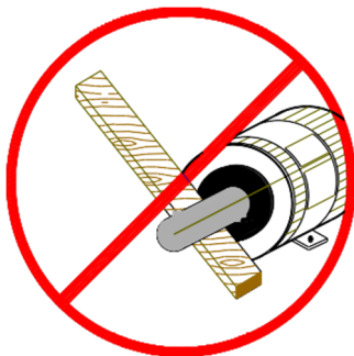
2x4 Wedged Against Driveshaft

The Fan Lock not only protects in times of a hurricane, but also offers true lockout/tag-out functionality. Without a Fan Lock, the only methods available to stop the free rotation of a fan and secure the fan to resist further free rotation are through unsafe work practices. To stop free fan rotation, a 2x4 would be wedged against the driveshaft to create enough friction to overcome the momentum of the rotating fan. To provide energy control, one end of a rope would be tied around a fan blade and the other end to the tower structure. These methods create obvious safety hazards and cause unnecessary stress on the tower's mechanical equipment. Installing a Fan Lock eliminates these safety concerns and protects the service life of the mechanical equipment.