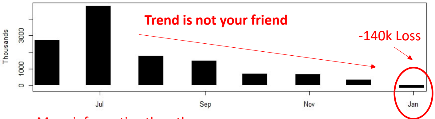
Change in Nonfarm Payrolls

More informative than the unemployment rate