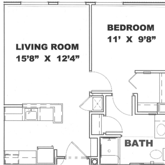
One Bedroom Example – 537 Sq. Ft.

Rent includes: electricity, water, heat and air conditioning, refrigerator and microwave.