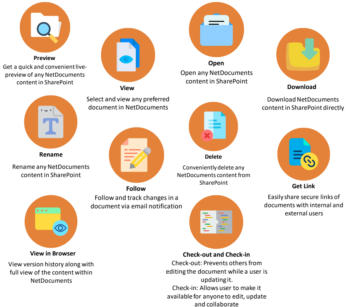
Fig 2: Features List

parts interface. For clients, this results in gaining value-added features of SharePoint that vastly boosts productivity.