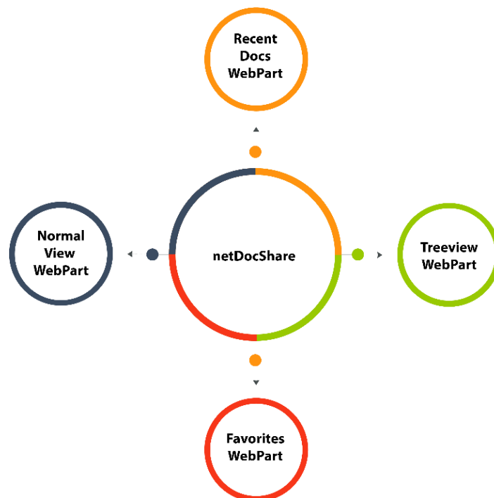
Fig 3: netDocShare Approach

netDocShare allows SharePoint users to use NetDocuments with filters, searches, and saved searches in the intranet pages of the firm. The solution provides web parts to search and view documents with distinct features with Recent Docs WebPart, Normal View WebPart, and Treeview WebPart. This allows users to easily navigate SharePoint for content stored on NetDocuments and extract relevant information and documents from cases. While every WebPart provides the ability to view and access documents, their functionality extends to include viewing Saved Searches, Filters, SharedSpace, Folders and Sub-Folders as well.