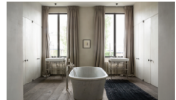
LOW COUNTRY LUXE, 19/01/15