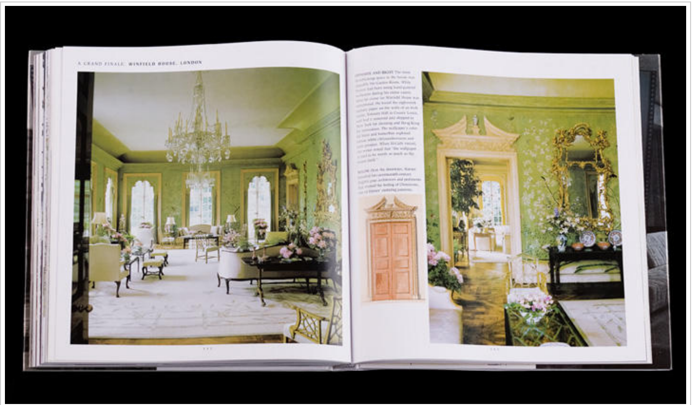
Haines's breathtaking Garden Room for the Winfield House in London features an 18th-century hand-painted wallpaper that came from an Irish castle.