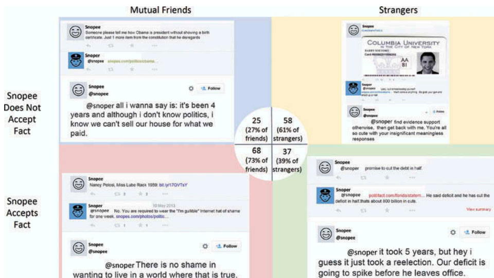
Figure 1. Frequency of Acceptance by Social Relationship

agreed with the characterization of the snope (correcting, non-correcting) and the snopee's acceptance of the fact. This yields 322 triplets, of which 229 (71%) are corrections and thus suitable for analysis of whether a snopee "accepts" a fact. As a check on robustness, we also analyze the full (451) cases from the point of view of each coder's interpretation (whether the snope was a "correction" and whether it was "accepted") and obtain substantively similar results (see supplemental Appendix).