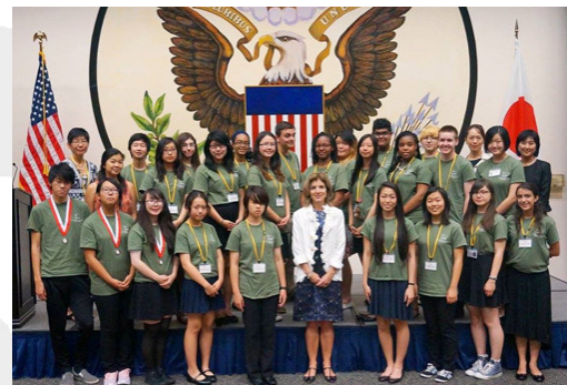
2015 National Japan Bowl, Kakehashi Project and Mazda Foundation participants meeting with Ambassador Caroline Kennedy