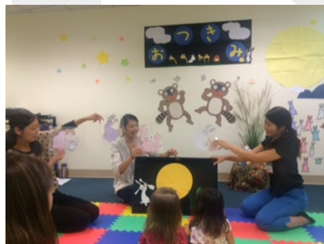
Ohanashikai volunteers and staff celebrating Otsukimi (Moon Viewing) for Ohanashikai children.