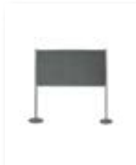
Tack Board Vert - 4' x 8' Hori - 8' x 4'