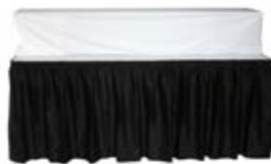
Table with Riser & Skirt

CANCELLATION POLICY: Table orders cancelled during or after show move in, including change order requests, will receive a 50% refund of original price.