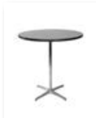
Gray Pedestal Table 30"D x 40"H (30" optional)