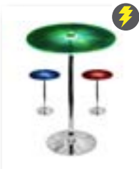
Lighted Pedestal Table (Electricity is not included)