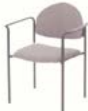
Padded Arm Chair