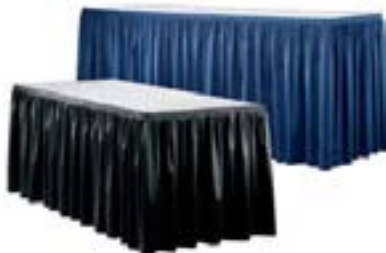
Table with Skirt

Show color will apply if no color is selected. Color availability is only guaranteed with pre-orders.