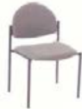
Padded Side Chair