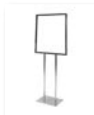
Chrome Sign Holder