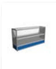
6' & 5' Display Case (6' Vert. Opt.)