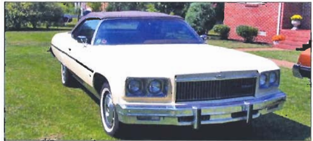
1975 Chevrolet Caprice Convertible, Low Mileage