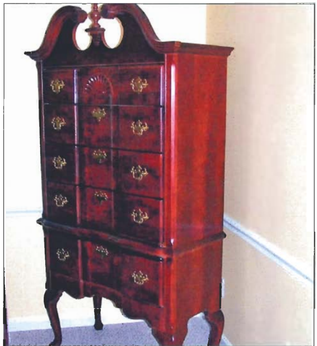
Cherry High Boy Chest