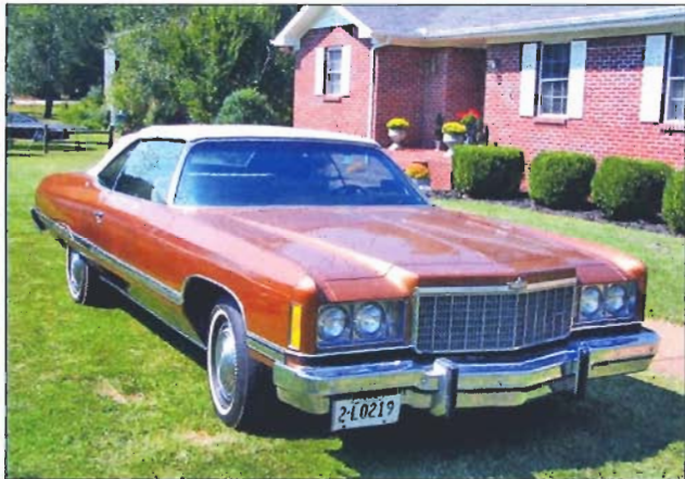
1974 Chevrolet Caprice Convertible, Low Mileage

Directions: From the east side of Waverly just across from Phillips 66, go across railroad tracks onto Powers Blvd. Go north approximately 1 mile to sale on left. See auction signs and arrows.