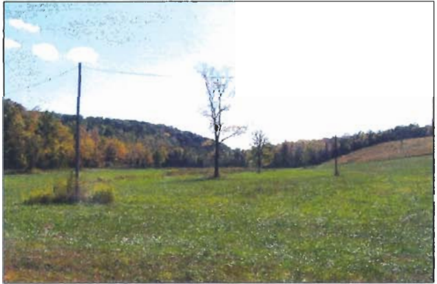
Another View of Pasture Showing Electricity Available to Property