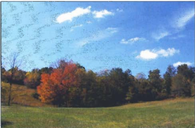
View of Beautiful Building Site with Woods Land