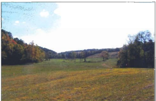
Partial View of One Mile Long Pasture Land