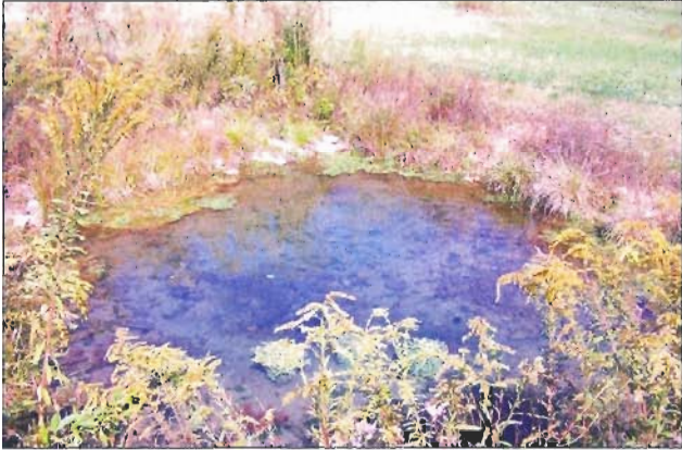
One of Several Year Round Springs

From Erin take Hwy. 49 to intersection and turn left. Go through TN Ridge and continue west on Hwy. 147. Follow to Cooley Ford Rd. approx. 3 miles and turn left on D.J. Rye Lane. Go 1/2 mile to sale site.