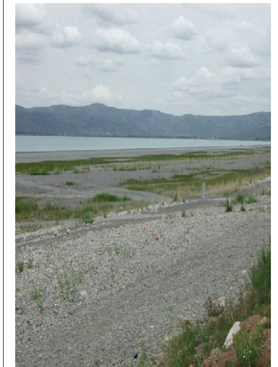
Exposed Lakebed and Public Beach User Information