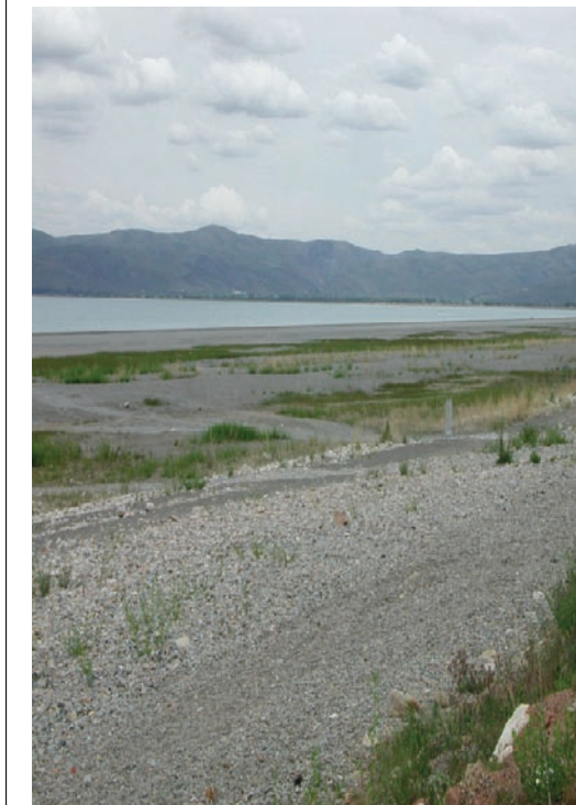
Exposed Lakebed and Public Beach User Information