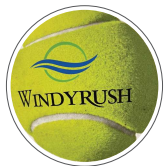
E $5.00 Car Magnet size 4" D