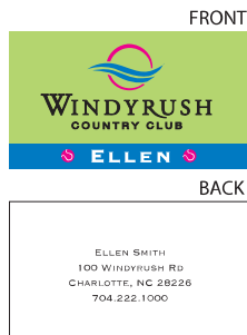
F $5.00 Personalized Laminated Bag Tag w/ clear hoop fastener FIRST NAME on FRONT Optional information on BACK