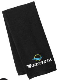
A $10.00 Black Towel size 24.25" x 15.25"