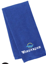
B $10.00 Royal Blue Towel size 24.25" x 15.25"

Check out our Brand New Windyrush Tennis Spirit Items Please fill out form and email to office@windyrush.com Cash, check, or PAYPAL accepted.