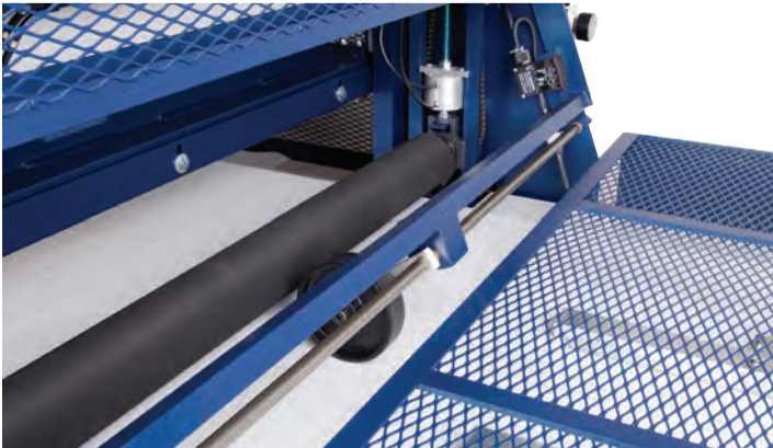
Detail of adjustable rubber-coated pinch roller and sheet sensor wheel.