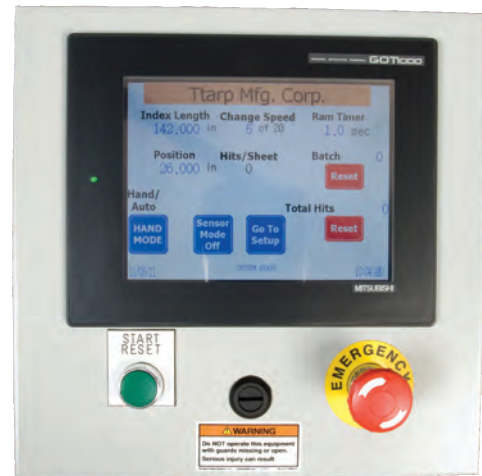
Touch-screen interface (mounts on a moveable console) enables easy set-up, easy adjustments, and easy recipe saving.