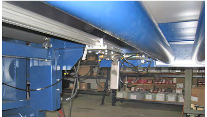
Automatic belt tracking features a new, heavy-duty design that is less susceptible to moisture and pressure fluctuations in compressed air. Easy to use and prolongs belt life.

Ttarp designs and manufactures a complementary range of capable, affordable, and maintainable fabricating equipment. Contact us for more information.