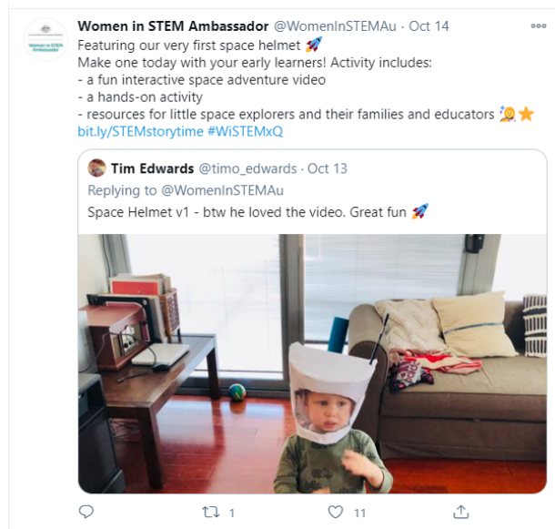
Image of tweet showing carer and child engaging with the STEM story time space helmet building activity.

To assess this priority area, the evaluation tracked and measured the influence of the Ambassador’s interactions and engagement with stakeholders in raising awareness and addressing gender inequity.