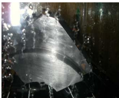
Gray iron treated with V-853 inside 100% Humidity Chamber

VAPPRO 853 Emulso is specifically developed to replace conventional oil rust preventatives. It can be diluted with water prior to application to produce a thin, transparent, tack-free corrosion inhibiting film with excellent water displacement properties.