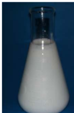
After dilution of 1:20