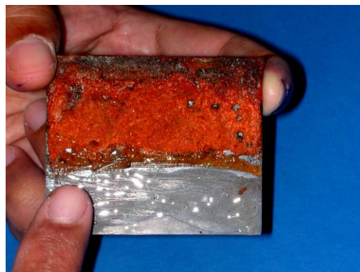
Treated with VAPPRO 810G