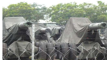
FIGURE 1 Heavy cannons on wheels covered with rough canvas fabric impregnated with a VCI.

The most commonly used vehicle is the high mobility multipurpose wheeled vehicle, also known as the Humvee, particularly in the deserts of the Middle East. The complex interaction of chemical and climatic factors, such as hot afternoons and cold nights, with dew condensation, intense