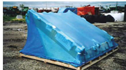
FIGURE 2 Wrapped military hardware on a wood pallet ready for moving.