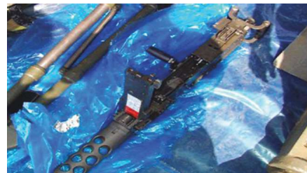
FIGURE 3 Weapon parts wrapped with transparent plastic sheets containing a VCI.

solar radiation, and salt-laden atmosphere as well as saline, brackish, and briny water, create a harsh corrosive environment. The military vehicles are damaged by corrosion, erosion, abrasion, and wear that impair vehicle mobility and long service life, requiring costly, ongoing maintenance. Plastics, elastomers, and composites are generally unsuitable alternatives because they deteriorate by physicochemical mechanisms.