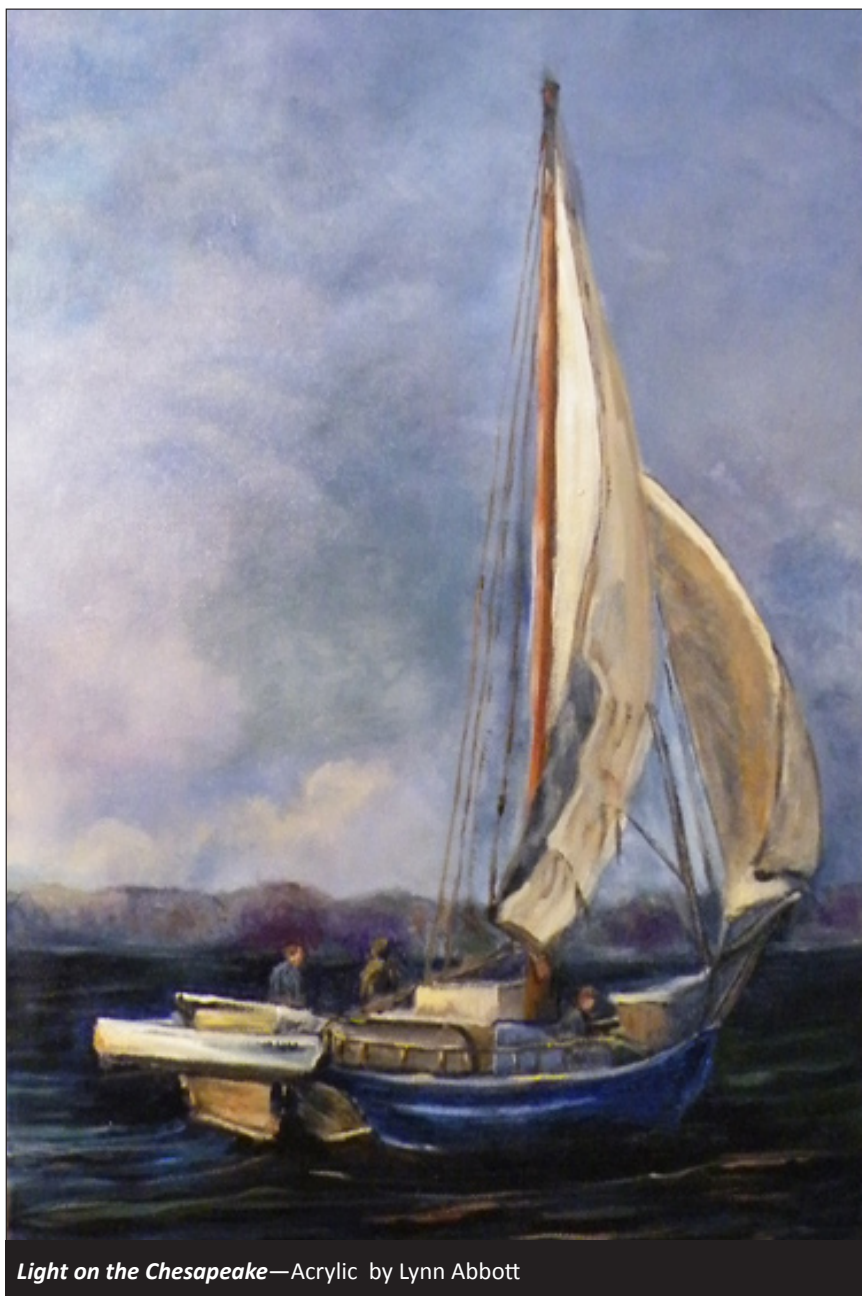
Light on the Chesapeake —Acrylic by Lynn Abbott